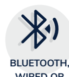
BLUETOOTH, WIRED OR MOUNTED